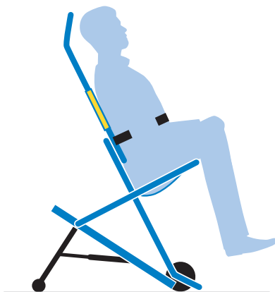
Standard Passenger Evac+Chair

Capable of carrying the largest of adults or 4 babies.